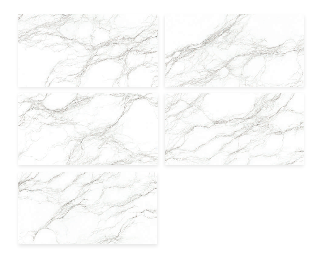
Effect: Nano Polished Size: 600x1200mm Thickness: 9mm Faces: 5

Porcelain | Different color | Rectified | Anti Slip | White Body